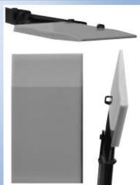
Fig. 2 Fitting tool 6.3 mm und 8.5 mm