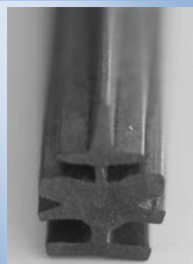
Fig. 3 Flatblade rubber without metalclip